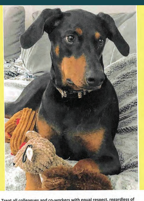
Treat all colleagues and co-workers with equal respect, regardless of their national origin, race, color, or their place in the animal kingdom